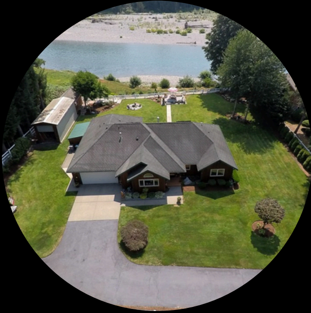
Before REimagined Group

In today's market, the first showing takes place online. The better photos you have online, the more buyer interest you will have. This is why REimagined Group uses a top-tier professional photographer, to allow you property's photos to stand out from the competition.