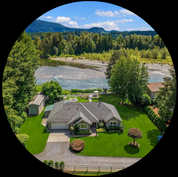
REimagined Group Listing